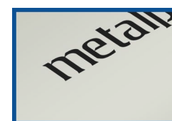
MATTE non-reflective with dull finish