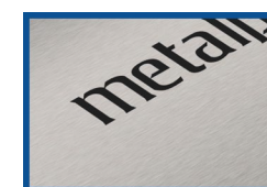
SATIN semi-gloss medium reflective material

Call 1-800-553-8871 TO ORDER or visit our website at usnameplate.com